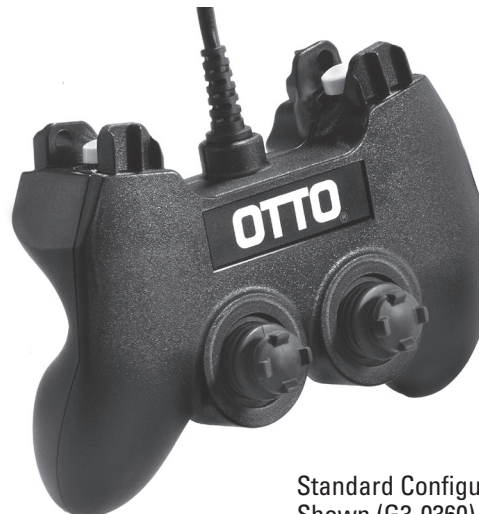
Standard Configuration Shown (G3-0360)